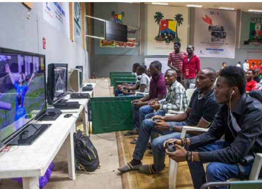
The finest of margins: Nigerian gamers have the potential to win on the world stage but are hampered by unstable power and slow speeds

enemy shot you before you pulled your gun. But because of your own latency, you're seeing that he wants to shoot, not knowing it's shot already."