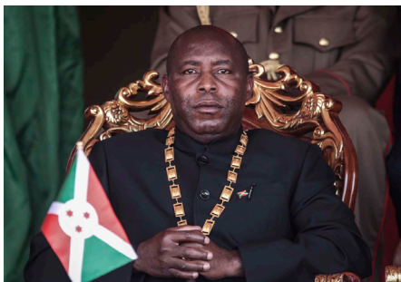
Sworn in: Burundi's new president Évariste Ndayishimiye at his inauguration at the Ingoma Stadium in Gitega on Thursday

And, in Uganda, musician-turned-parliamentarian Bobi Wine has updated his profile to reflect his “civil union” with senior opposition politician Kizza Besigye, as they form a “united force