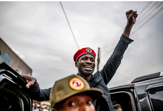
United front: Ugandan popstar-turned-politician Bobi Wine has joined forces with opposition leader Kizza Besigye

security forces which has seen citizens locked up, injured and killed. Now a coalition of opposition and civil society groups are resuming demonstrations – if they shout loud enough, maybe Conde will be forced to listen.