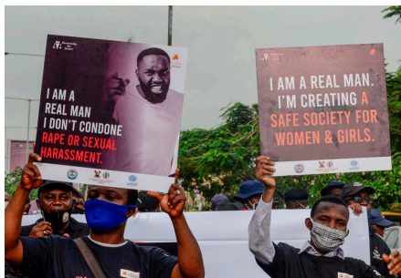
Protect women: Men Against Rape protested against gender-based violence in Lagos last week

D’banj is an ambassador for the ONE Campaign, an anti-poverty group. “ONE is aware of the allegations against D’banj and monitoring the situation closely. We believe in justice and accountability, and it is crucial that this