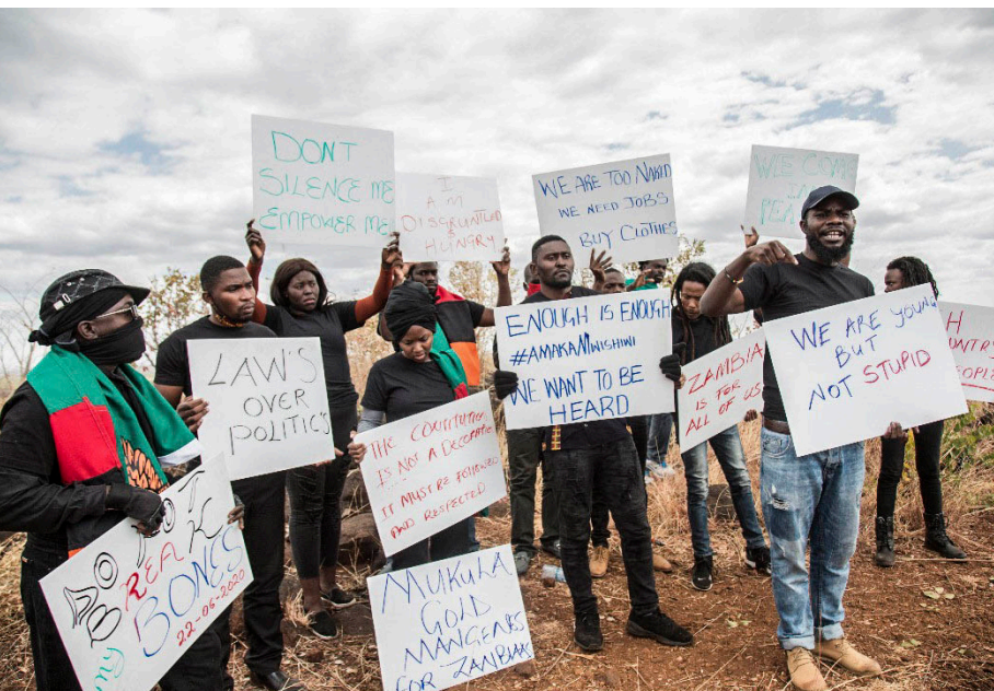
New ideas: Young Zambian activists livestreamed their protest from the bush outside Lusaka

said. “It was two wins – they were heard widely, and they left power with egg all over their faces. Young people feel very invigorated.”