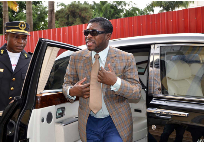
Big spender: Teodorin Obiang is Equatorial Guinea's vice- president, and son of the president