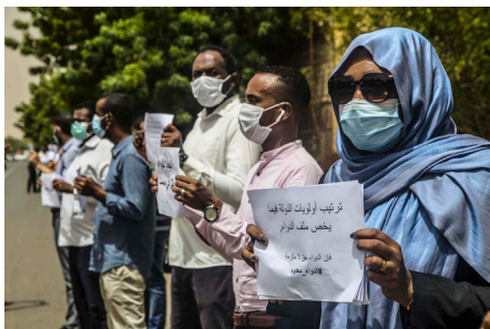
Ailing: Pharmacists in Sudan protest against medical shortages