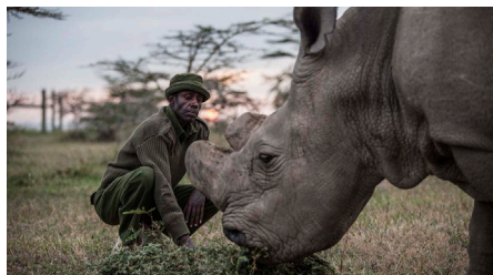
Functionally extinct: Sudan, pictured above at Ol Pejeta, was the last male northern white rhino