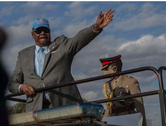
Unpopular: President Arthur Peter Mutharika waves at supporters as he arrives at a campaign event in Lilongwe on June 17, 2020

controversial election win in May last year, calling their decision a “judicial coup”. But the judges held firm, refusing to be either intimidated or bribed.