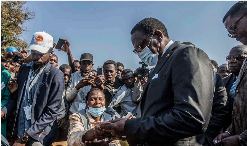
President-elect: Lazarus Chakwera was a pastor before turning to politics

But it won't be easy, cautioned Joseph Chunga, a political science lecturer at the University of Malawi. "Chakwera's first assignment should be putting in place a government machinery that can deliver. As it stands, the new leadership will be naïve if it proceeds on assumption that the current government system is in shape to serve the nation."