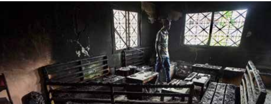
Lost in translation: This restaurant in Buea was razed in fighting between Cameroon's military and separatist rebels

translations were never reliable - if you could not refer to the original French question, you could go seriously off topic.