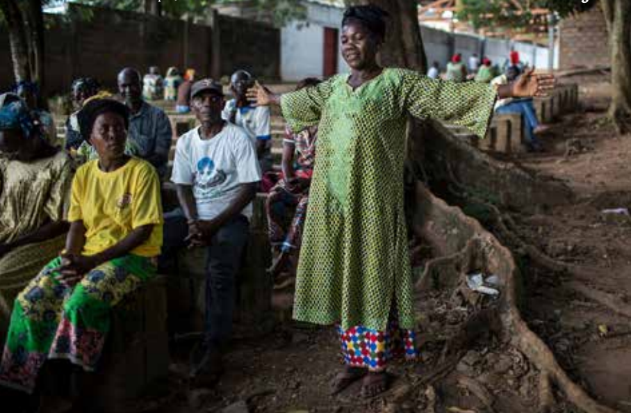
Respite: A group counselling session in Bangui, Central African Republic