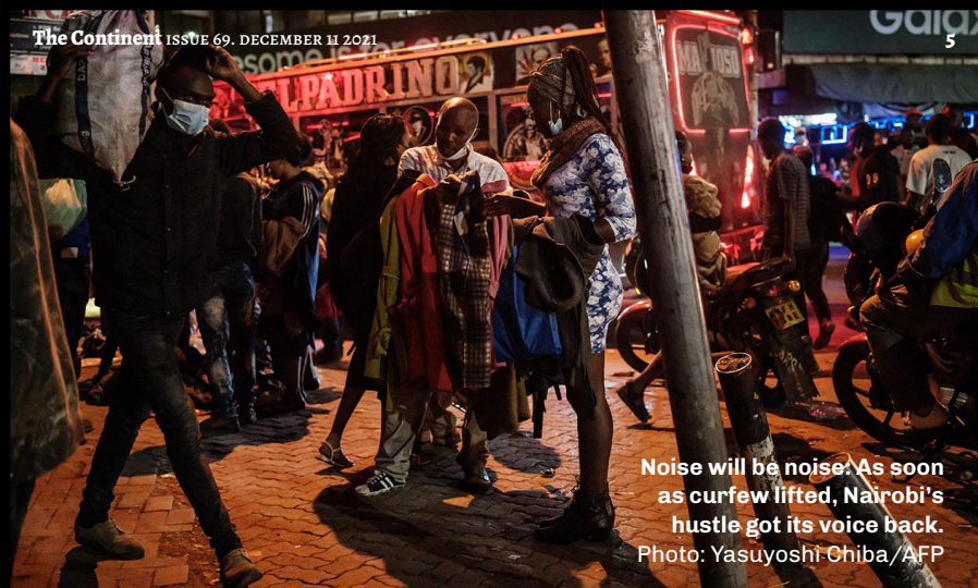
Noise will be noise. As soon as curfew lifted, Nairobi's hustle got its voice back.

covered in graffiti and trumpeting as it advances. On boarding the matatu, the music from poorly tuned speakers hits me, usually at high decibels. The crew, despite the fact that I am a fare-paying passenger, meets any attempt to request turning down the volume with hostility.