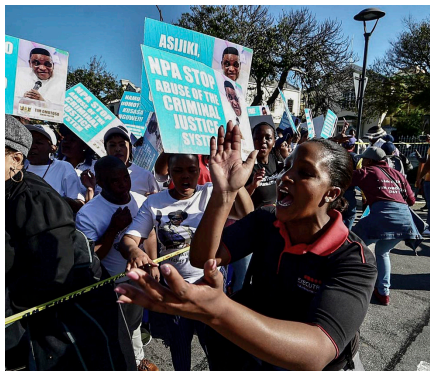
See no evil: Support for Pastor Timothy Omotoso, accused of human trafficking and rape.

The prosperity gospel promises power to those who feel helpless and submerged in the storms of socioeconomic crisis. But it is ultimately a hollow call because it masks the true nature of poverty, and so leads societies away from tackling it. Instead of questioning the inefficient or self-serving economic policies of politicians, prosperity preachers shame congregants for lacking the