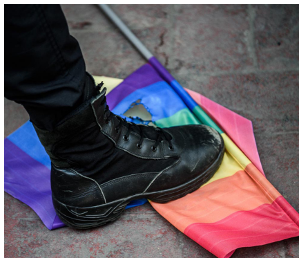
Tyranny: When human rights are cast aside, democracy has failed.

But a religious framing and ahistorical claims about the country's culture have swayed public opinion this time in favour