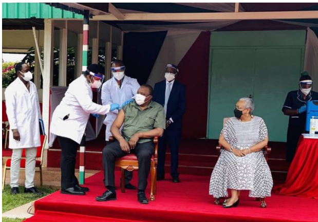
Sleeves up: Elders are leading by example, but it's time for the youth to show up too.

pushed the rollout of vaccines for human papillomavirus (HPV). This is the primary cause of almost all cervical cancer cases, and the vaccine has been shown to have a dramatic effect. The earlier a person is vaccinated, the better it is in protecting them. The government said it would be administered to all schoolgirls over the age of 10.