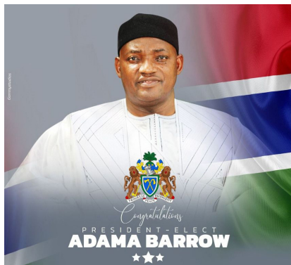
Festive spirit: Adama Barrow's Christmas card to himself.

The Gambia's President Adama Barrow was also invited, but will probably be too busy celebrating winning another term in office. He's promised to do all he can to "make The Gambia a better place for us all". The day after Barrow's win was announced, supporters of opposition candidate Ousainou Darboe took to the streets in protest and predictably authorities joined in the festivities, and even brought out the tear gas. But then is it really even Christmas without it?